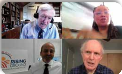
Three virtual installments of the 190th Anniversary Discussion Series.